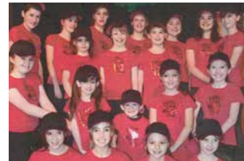
Can you recognise any of these smiling faces?

Comedy Capers is passionate about keeping live theatre in the village, keeping their ticket price low so that everyone can have access to it.